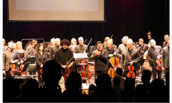
Phoenix Symphony REVERB performance featuring the voices of Circle the City patients and providers.