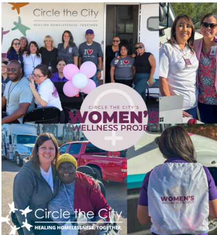
Women's Wellness Events: Mammogram screenings and health check ups for women facing homelessness.