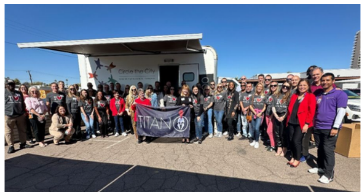
Titan 100 annual service day. Assembly of 1,000 kindness kits by CEOs & C-level executives.