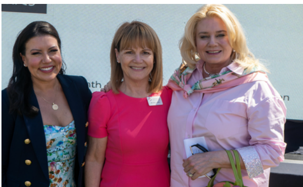
16th Annual Garden Tea & Silent Auction at The Scottsdale Resort at McCormick Ranch.