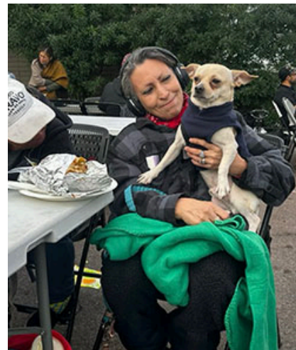
Burrito breakfasts for patients at the Parsons Family Health Center.