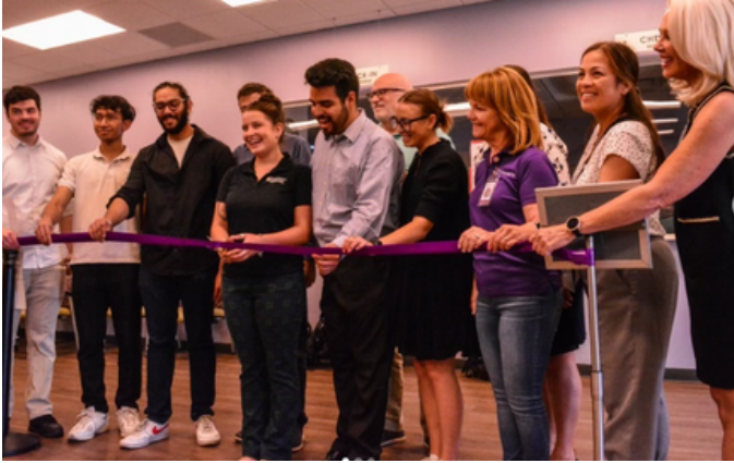
Grand opening of the Downtown Family Health Center expansion.